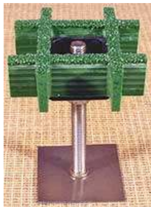
Stainless Steel Pedestal