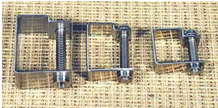
'G' Panel to Panel Joining Clamps