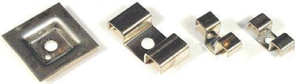
Square and 'M' holding-Down Clips