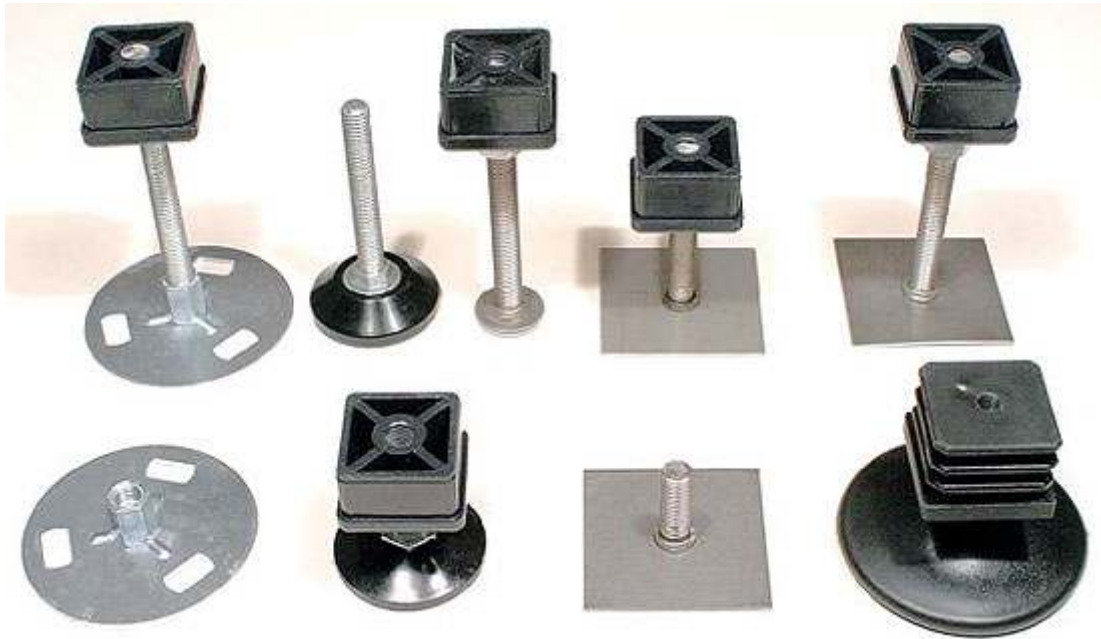
Various Adjustable Stainless Steel Pedestals are available for raising panels above floor level