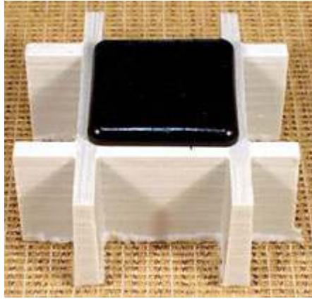
Optional plastic insert to Raise Grating 5mm