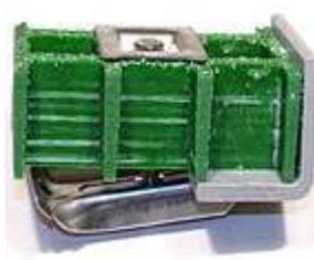
Side View: Panel