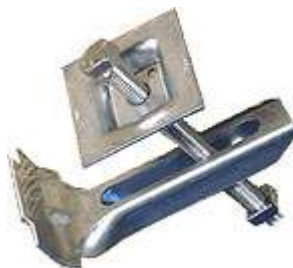
Panel Holding-Down 'Clamp' Assembly