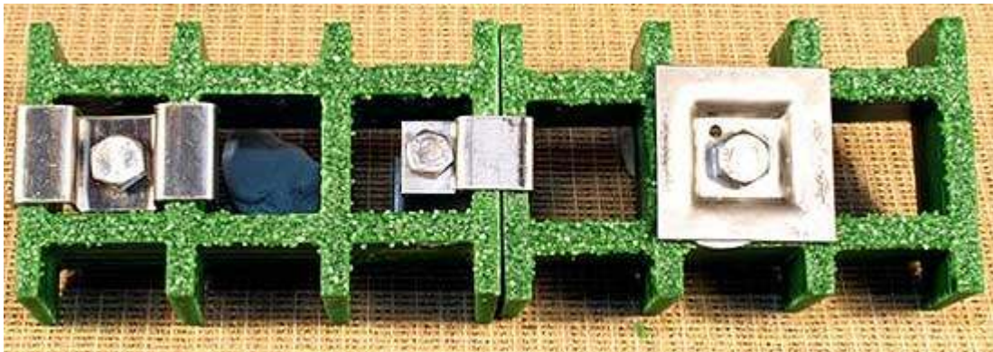
'M' Panel Clip