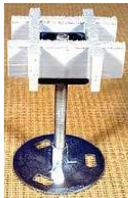
Stainless Steel Pedestal