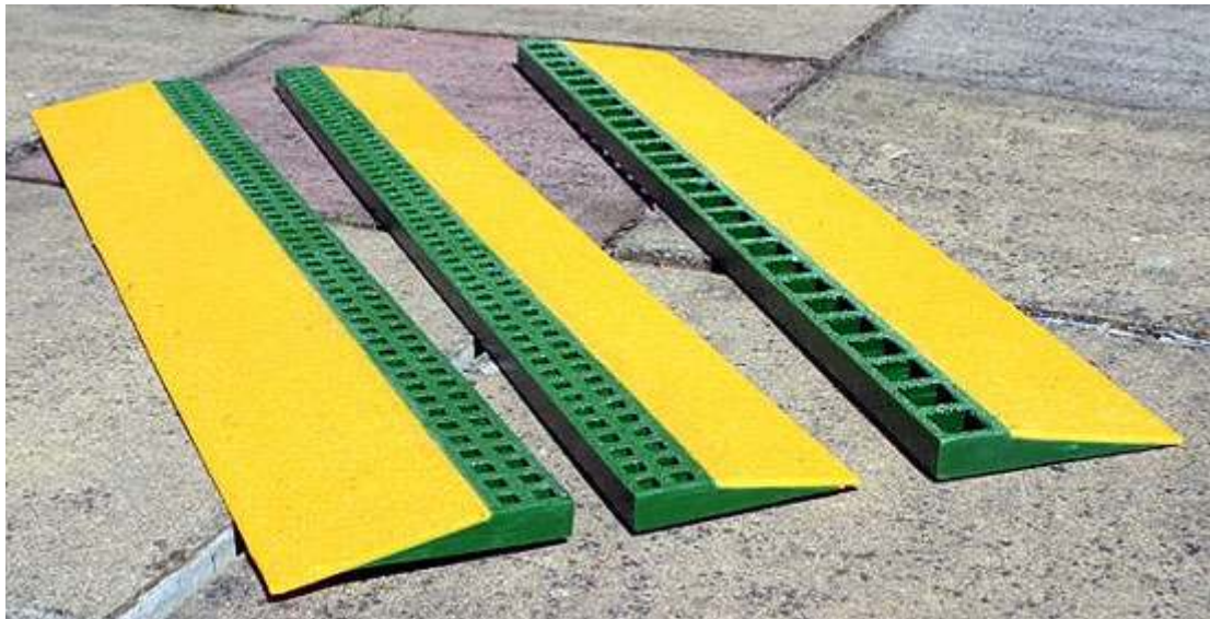
Fibreglass Edging Ramps