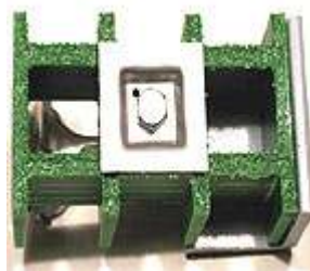
Top View: Panel Holding-Down 'Clamp' System