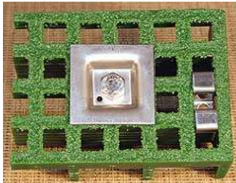
Square and 'M' Holding-Down Clip