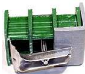
Bottom View: Panel